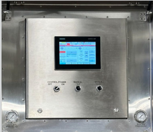
Pressure Relief Valve and Letdown Valve Hydraulic Control Console