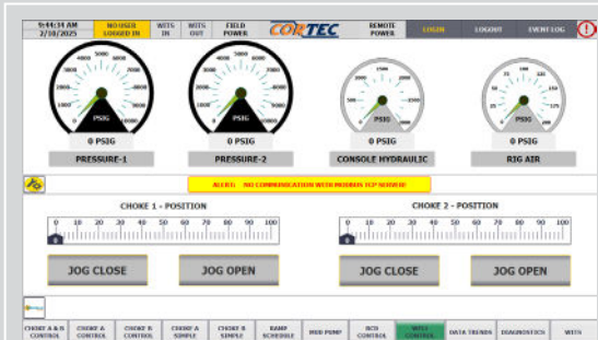
The Control Screen from a CX-EC 16C Dual Choke Well Control Console with Remote Control