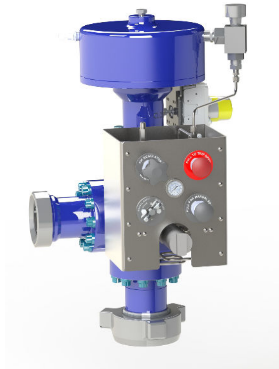
CX-RV26 pneumatic system shown with an integrated control system mounted.