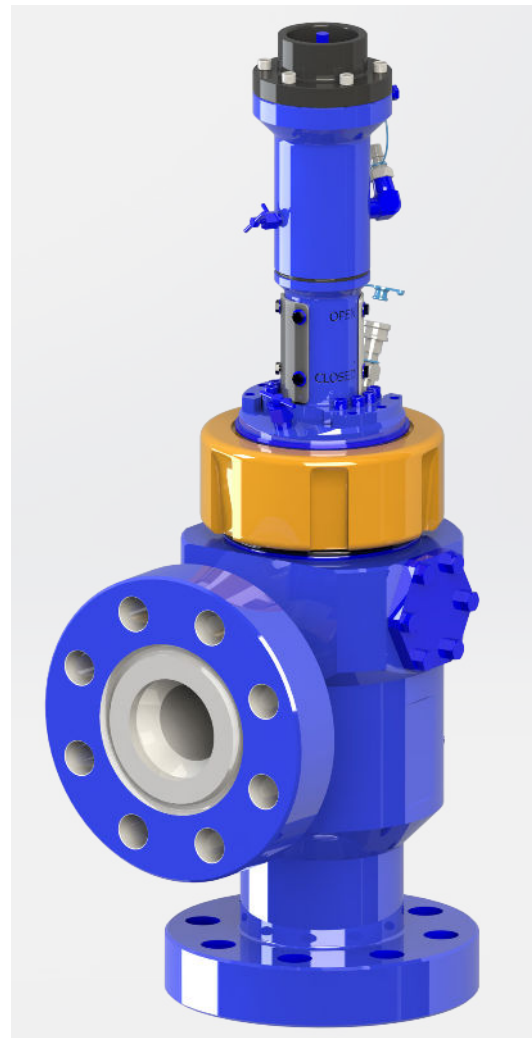
CX-HB3.0 Hydra-Balanced Choke