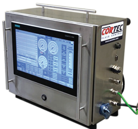
Remote HMI: 20"W, x 12"D x 18"H, ~58 lbs.